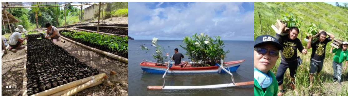
The challenging transport of seedlings from our nursery to the future Temboan Forest

For example, an ambitious reforestation funded by smaller and larger sponsors. Powered by state-of-the-art technology, they will be able to monitor the growth of their trees and measure the related carbon absorption for the benefit of the planet.