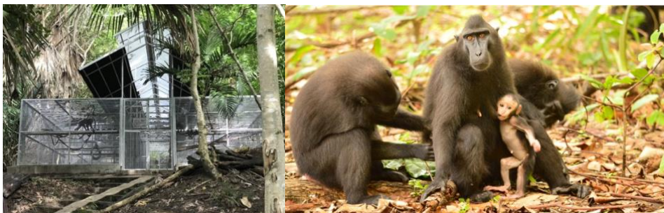
New enclosures for the Tasikoki macaques and their release into the wild

Thanks to a generous gift from the Babel Foundation, we have been able to complete the renovation of our primate enclosure complex. Importantly, we have also been able to release two groups of the endangered North-Sulawesi black-crested macaque into their natural habitat. This created much-needed space for the endless stream of new arrivals. Even during a pandemic, the animal trafficking in Indonesia sadly continues.