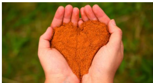
Palmsugar breakthrough benefitting all stakeholders

In a difficult year, the Tomohon factory team has achieved a major breakthrough. After complying to all domestic and international organic certification standards, a major international customer has been secured doubling the palmsugar output and sales. This is terrific news for all stakeholders: first of all the sugar palm plays a pivotal role in Masarang's reforestation programs; secondly, the sugar juice provides additional income to local farmers and tappers, and lastly, the Tomohon palmsugar factory will be able to make a much-needed financial contribution to the Masarang Indonesia foundation.