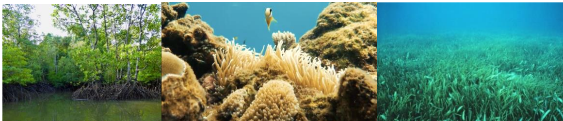
Temboan Beach initiatives also protect the marine ecosystems from mangroves to coral reefs to sea grass beds

Other Temboan initiatives include protection of the endangered Leatherhead and other turtles, restoration of the spectacular coral reefs, release of birds and other animals from Tasikoki rescue center, and zero-waste mini-factories producing organic palmsugar and coconut products. Obviously, all of this will happen with the active involvement and engagement of the neighboring communities.