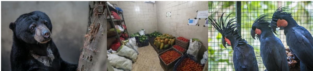
Tasikoki desperate to buy daily food for the animals

Similarly, the financial income of Masarang Indonesia has been hit severely. No more volunteers helping out in Tasikoki, no more international school visits, and no more tourists visiting the Amfitheater and the Eco-lodge. Meanwhile, the operational costs continued and the Masarang team had to scramble to feed the animals and pay the employee salaries.